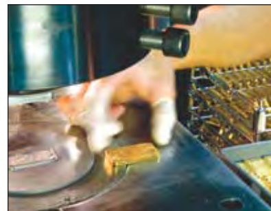
Manufacturing minted bars at PAMP (Switzerland).