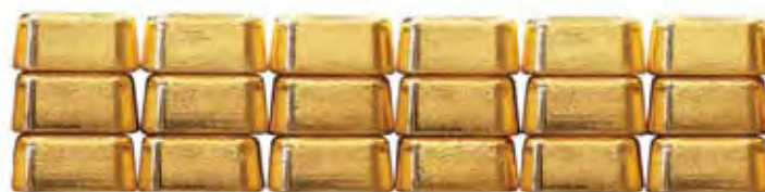
London Good Delivery 400 oz bars manufactured by Heraeus (Germany).

Source: Associations and Exchanges. * Aurubis AG retains the Norddeutsche Affinerie official stamp.