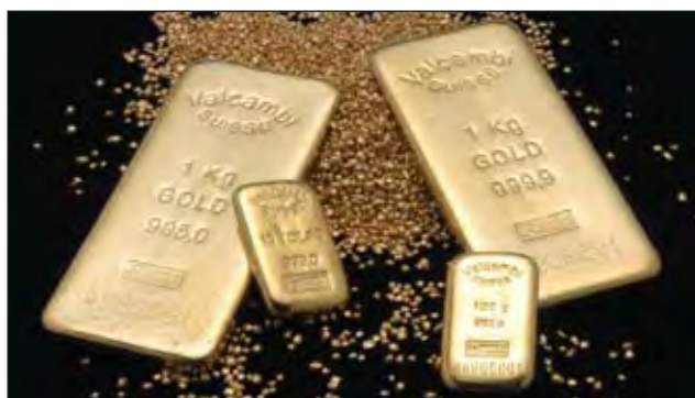
Small cast bars manufactured by Valcambi (Switzerland).

Source: SHFE * Also accredited to LBMA (4 refiners)