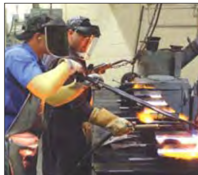
Manufacturing London Good Delivery 400 oz bars at Johnson Matthey (USA).

In the case of the Istanbul Gold Exchange , brands issued by some entities (and manufactured by approved refiners) are also accepted as “good delivery”. Notably, the relevant bars of Commerzbank as they are manufactured by Argor-Heraeus .