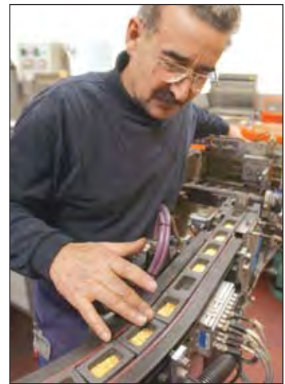
Manufacturing small cast bars at Metalor (Switzerland).

For supplementary information, including any changes to their lists since this section was compiled, reference can be made to their websites.