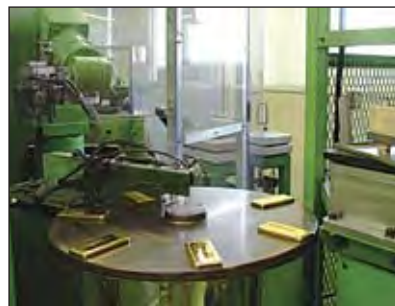
Manufacturing kilobars at Tanaka (Japan).