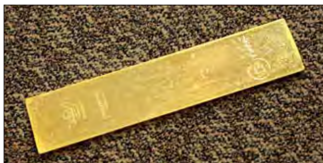
Long, flat 3000 g bars are produced by manufacturers accredited to the SGE and SHFE in China.