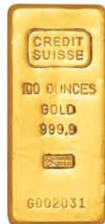
COMEX Good Delivery 100 oz bar.