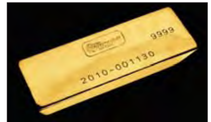
The Perth Mint Australia

More than 50 bar weights – in gram, troy ounce, tola, tael, baht and chi – are manufactured around the world.