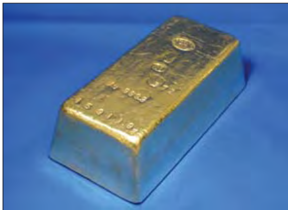
Japan Mint Japan

3000 g bars are traded on the Shanghai Gold Exchange.