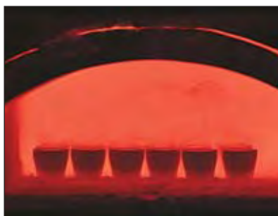
Valcambi Switzerland Assaying Laboratory.

Most minted gold bars have a fineness of 999.9.