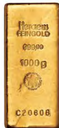
Heraeus Hong Kong

Some refiners manufacture gold bars or granules with a purity of 999.99, mainly for use in the fabrication of industrial products.