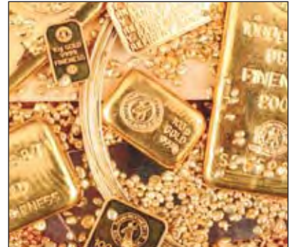
Rand Refinery South Africa

Some refiners advise that other large bars are also occasionally made to precise or approximate weights. For example, in ounces (250 oz and 50 oz) and in grams (2 kg, 5 kg and 10 kg).