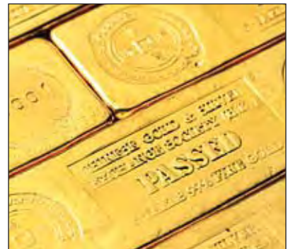
Lee Cheong Hong Kong

In the past, many refiners produced bars of this weight. The Japan Mint manufactured 500 oz bars from 1875 until 1988.