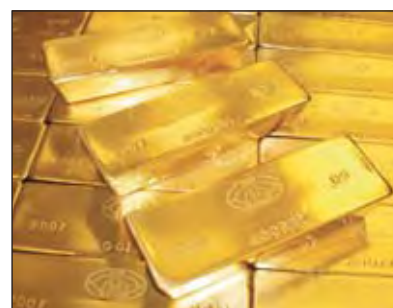
AGR Matthey Australia

All refiners now stamp LGD bars with the year of manufacture.