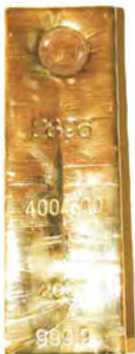
Royal Canadian Mint Canada