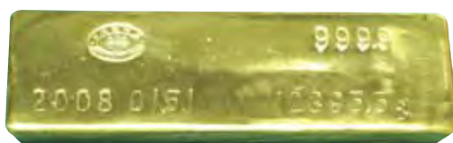
Japan Mint Japan