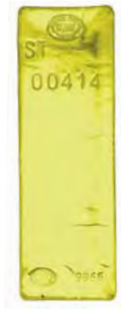
Historical LGD bar.

For further information, refer to the website of The London Gold Fixing Limited : www.goldfixing.com