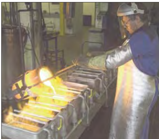
Metalor (Switzerland) has manufactured LGD bars since 1934.

The London Gold Fixings have relied on LGD bars for the settlement of transactions since 1919.