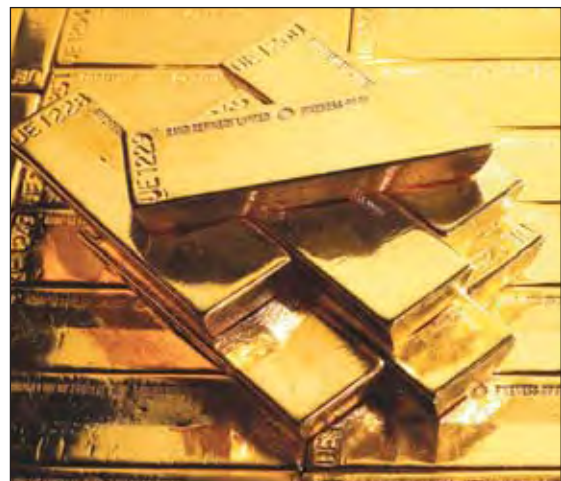
Rand Refinery (South Africa) has manufactured LGD bars since 1921.

Refer to disclaimer on website: www.goldbarsworldwide.com