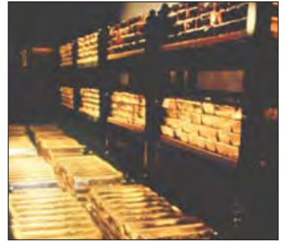
The Bank of England stores hundreds of thousands of LGD bars on behalf of central banks around the world.

Minimum acceptable fineness is 995.0 parts per 1,000 parts fine gold.