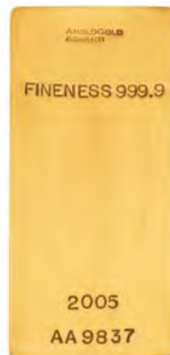
AngloGold Ashanti Brazil