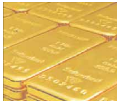
Dubai Good Delivery 1000 g bars