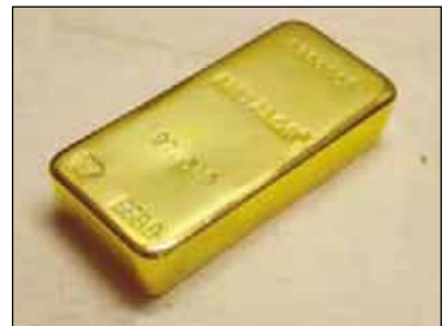
COMEX Good Delivery 100 oz bar.