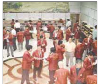
The CG&SES dates its origins back to 1918.

Refer to disclaimer on website: www.goldbarsworldwide.com