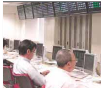
TOCOM was established in 1984.