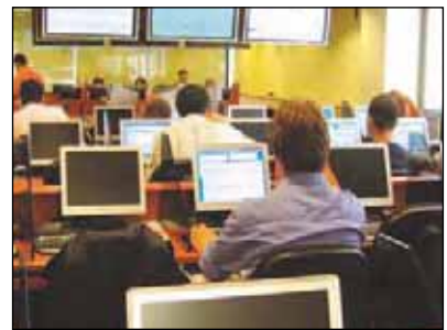
The IGE opened in 1995.