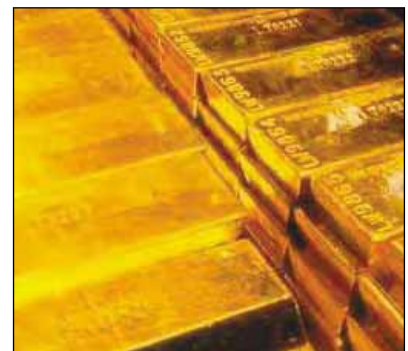
The LBMA was incorporated in 1987.