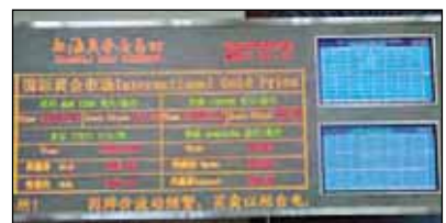
The SGE opened in 2002.