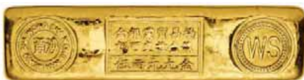
Hong Kong Good Delivery 5 tael bar