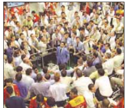
The BM&F has traded gold since 1986.