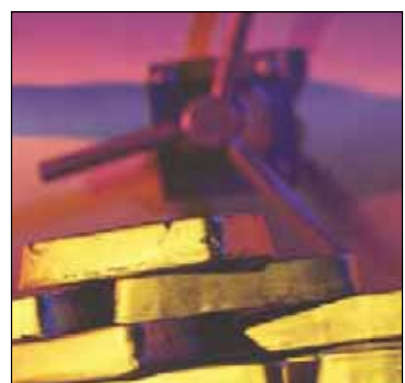
The DGCX opened in 2005.