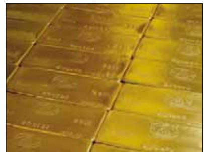
AGR Matthey Australia

More than 50 bar weights – in gram, troy ounce, tola, tael, baht and chi – are manufactured around the world.