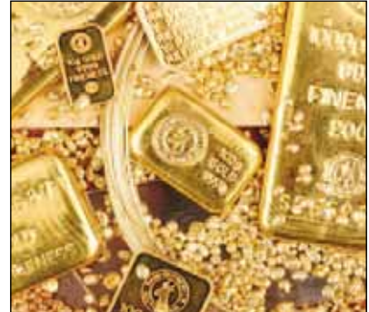
Rand Refinery South Africa

Some refiners advise that other large bars are also occasionally made to precise or approximate weights. For example, in ounces (250 oz and 50 oz) and in grams (2 kg, 5 kg and 10 kg).