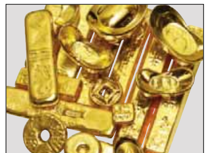
Baht bars Thailand