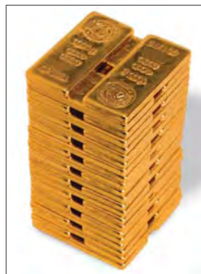
Kilobars have been manufactured for Turkey and the Middle East since 2006.