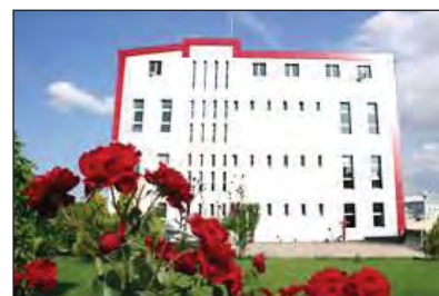
The company opened its large refinery in Istanbul in 1996.