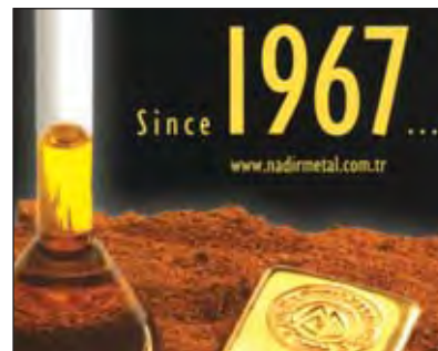
Nadir, established in 1967, has refined gold in Turkey since 1975.