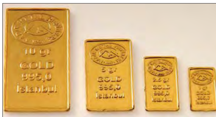
Minted bars have been manufactured since 2007.