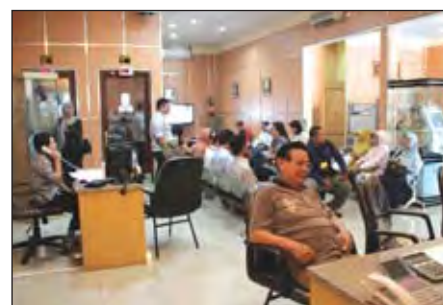
Logam Mulia sold gold bars to approximately 10,000 private investors at its on-site shop in 2010.