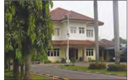
The Logam Mulia Precious Metal Refinery has refined gold in Jakarta since 1937.

The company, incorporated in 1975, has been listed on the Indonesian Stock Exchange (since 1997) and on the Australian Stock Exchange (since 1999). Shares: Indonesian Government (65%), public (35%).