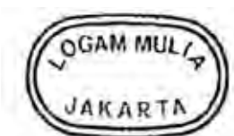
On the reverse side of kilobars and other small cast bars since 1994.