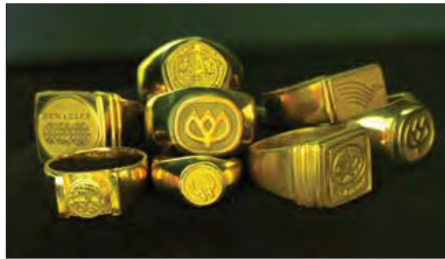
Logam Mulia manufactures an extensive range of gold jewellery, including chains, pendants and rings.