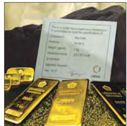
Logam Mulia has manufactured kilobars for the international market since 1992.