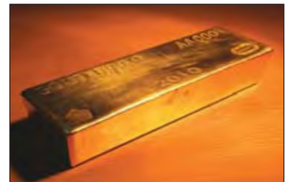
Logam Mulia has manufactured London Good Delivery 400 oz bars since 1999.