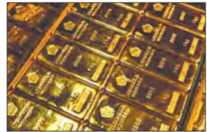
The manufacture of kilobars is being automated during 2011.

The reissue of the bars with a vertical format and laser watermark in 2011 was done to improve their quality and security.