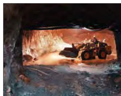
Antam has mined gold at its Pongkor mine in West Java since 1994.