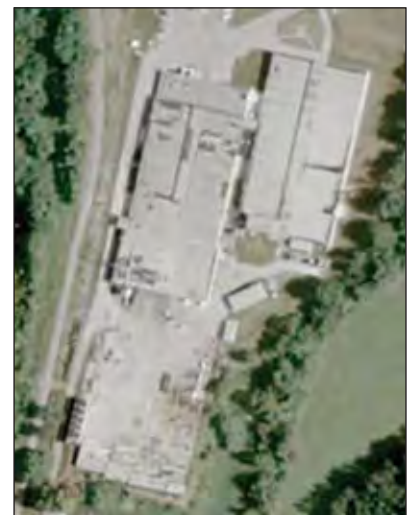
The company's industrial complex is located on a 113-acre site at Beaver Pike in Jackson, Ohio.