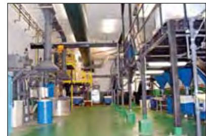
The company's new Miller chlorination plant was commissioned in January 2012.

In 2013, OPM also started to incorporate a stylized "O" (standing for "Ohio") on newly minted products - replacing a mushroom motif that had been applied since 2012.