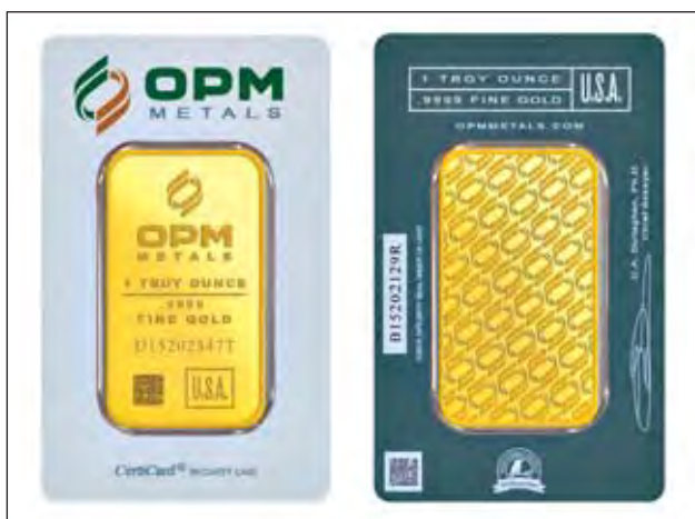
Minted 1 oz bars are sealed in tamper-proof CertiCard® packaging.