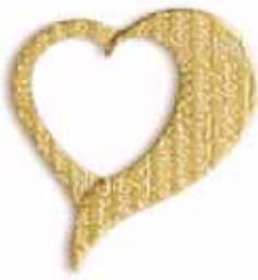
Flame of Love 4 g