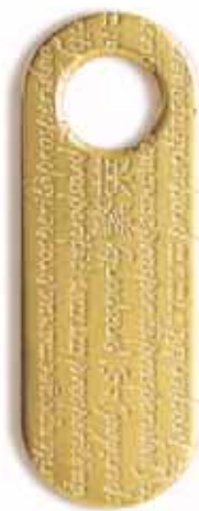
Icône 15 g