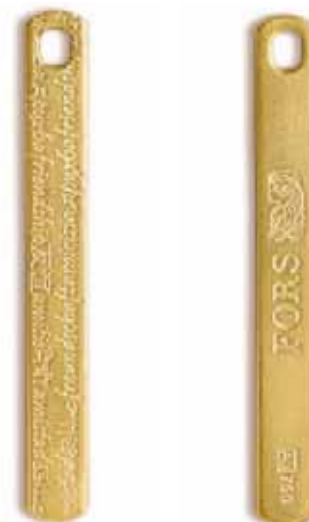
Éternel 6.5 g

The bars in this bulletin are shown 150% to actual size.