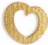
Wave of Emotion 2.4 g