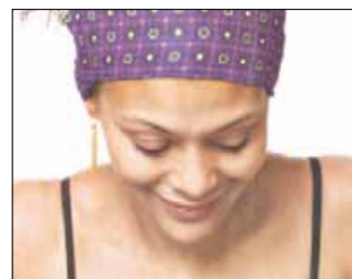
FORS talisman bars, launched in 2006, are also worn as pendants.