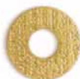
Plenty 2 g