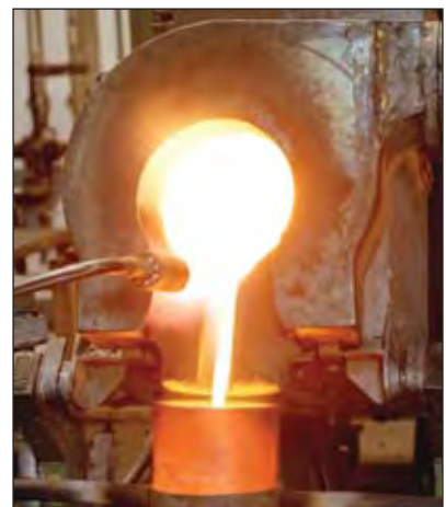
Pouring molten gold.