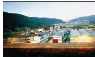
Valcambi has been a major refiner and bar manufacturer for more than 40 years.