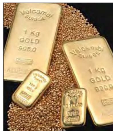
Kilobars are manufactured to a fineness of 995, 999 or 999.9 for the international market.