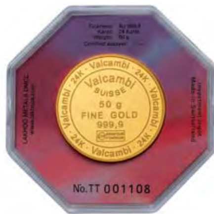
Examples of packaging for minted bars. Not in actual size.