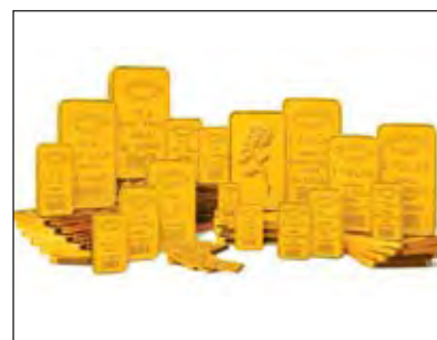
The company launched an innovative range of 15 rectangular minted bars in 2003 – 2005.