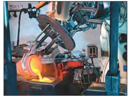
Casting gold at the large refinery in south eastern Switzerland.

The company has its own in-house design workshop and manufactures its own master tools and dies.