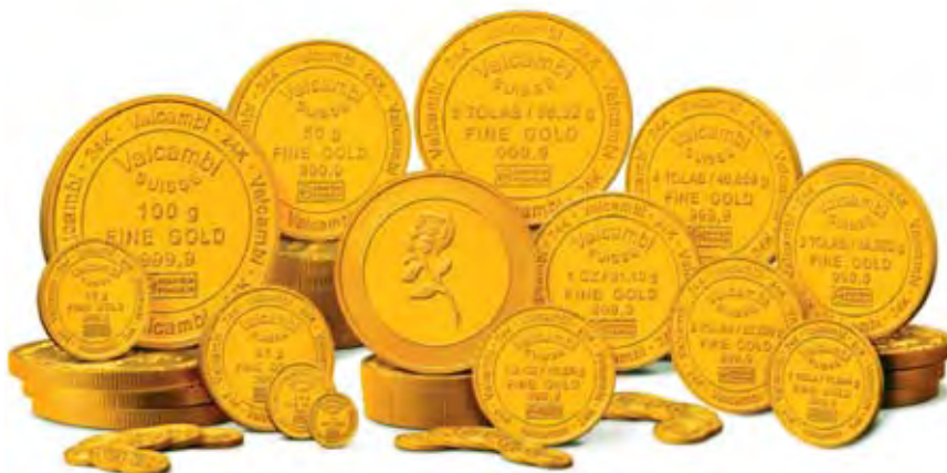
A range of 14 round minted bars was launched in 2005.