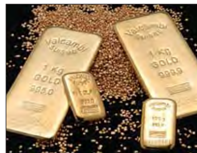
The new range of cast bars was launched in 2003.

Fax: + 41-91-695 5353 or 5354 Website: www.valcambi.com