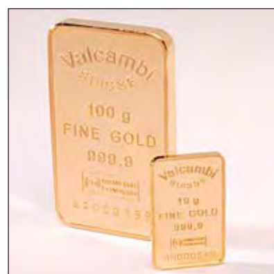
The company's innovative minted bars include frosting on selected surfaces.