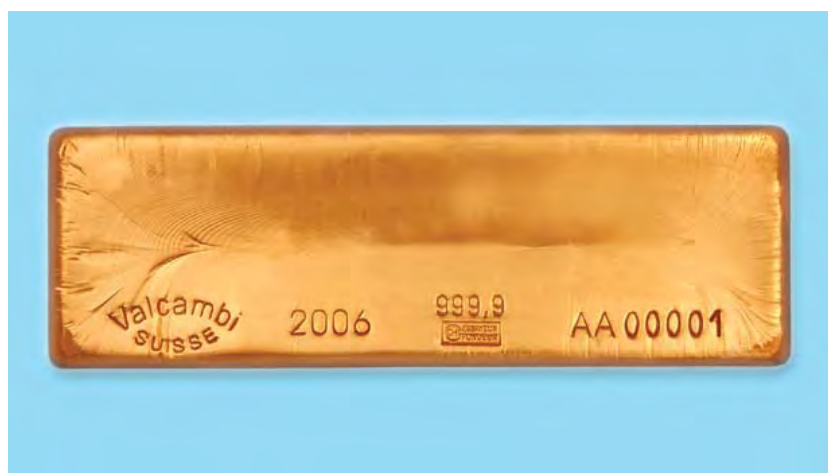
Valcambi SA has manufactured London Good Delivery bars since 1968.

Refer to disclaimer on website: www.goldbarsworldwide.com