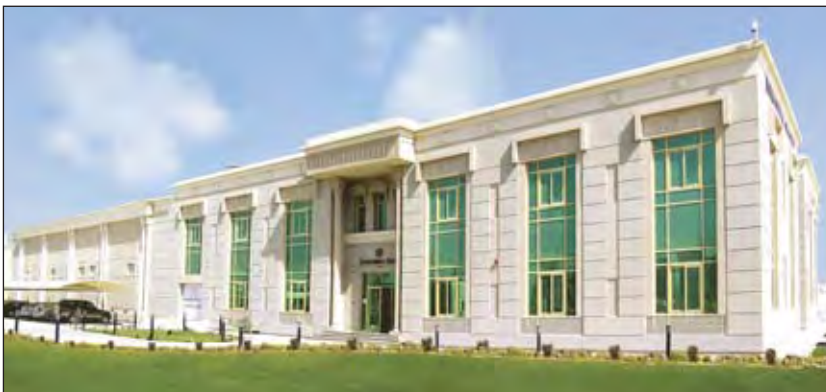
Emirates Gold opened its new refinery in Dubai in 2004.