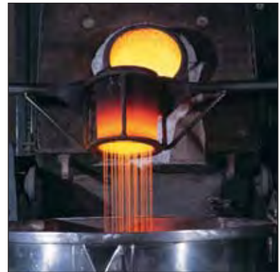
Pouring molten gold to make gold granules.