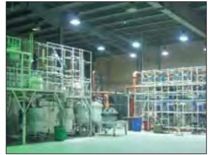
The new DMCC-accredited gold refinery was opened in 2004.

It has its own in-house design workshop and manufactures its own master tools and dies.