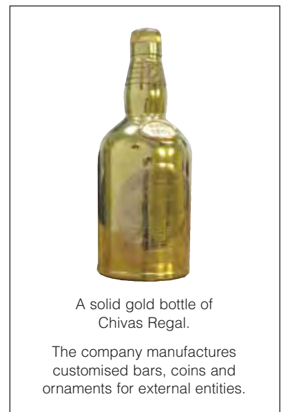
A solid gold bottle of Chivas Regal.

The company manufactures customised bars, coins and ornaments for external entities.