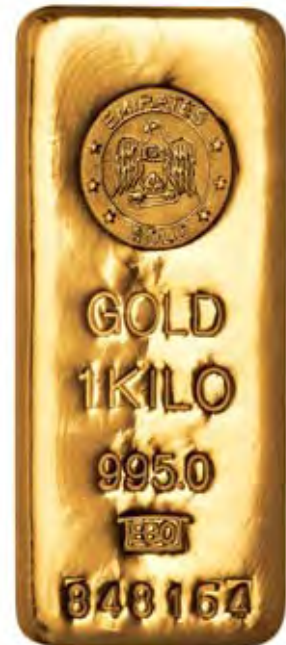
Emirates Gold is the largest manufacturer of cast, minted and pendant bars in the Middle East.