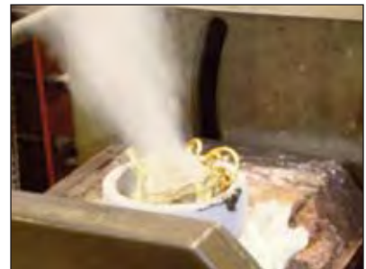
The company is a major international refiner of old gold scrap.