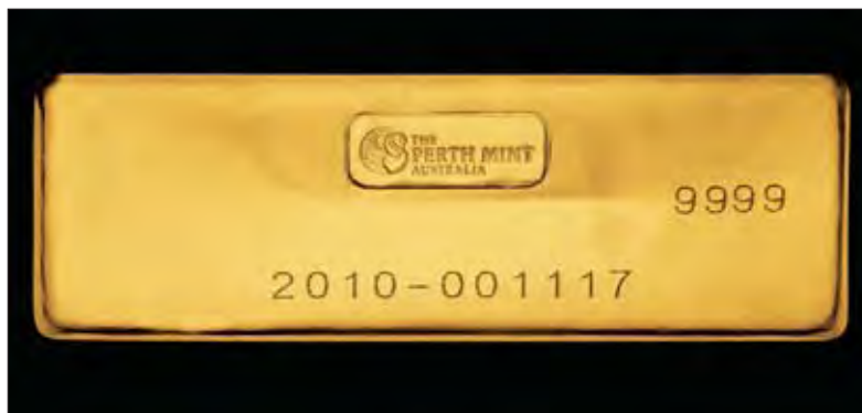
London Good Delivery 400 oz bar.

The current official stamp, which has been applied to smaller cast bars since 1972, will be changed during the course of 2010.