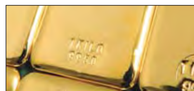
Kilobars are manufactured for the international market to a fineness of 995 or 999.9.

During the 1990s, the 10 tola bar (1995) was issued, followed by 500 g, 250 g and 100 g bars (1998).