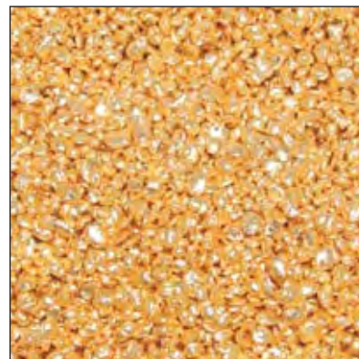
Gold granules for the jewellery industry.

On cast and minted bars, 50 oz and less, issued by The Perth Mint since