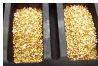
Bar moulds containing exactly a kilo of gold granules prior to melting.