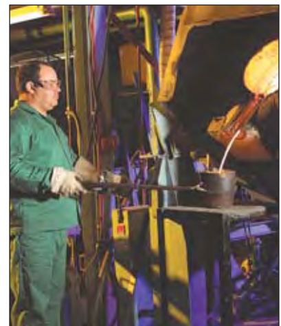
The company has refined almost one third of all the gold ever mined.