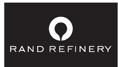
Rand Refinery launched its new logo in September 2011,