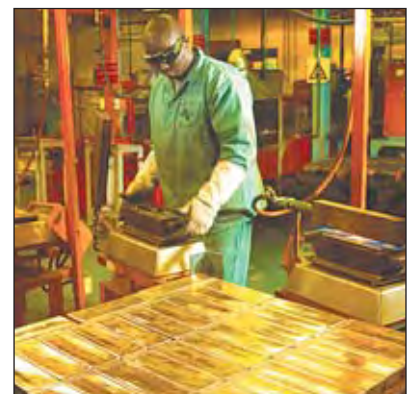
The company has manufactured London Good Delivery 400 oz bars since 1921.