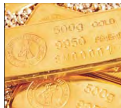
The company launched its 500 g bar in 2005.

1000 g (995): 2 letters, changed once 999,999 bars have been manufactured. 5 numbers record the bar serial number. For example, "SS 142,976" means the 142,976th bar made since the current letters "SS" were selected. A year date has been stamped on the bars since 2008.