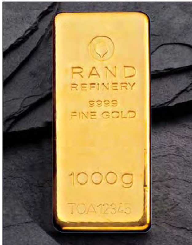
Illustrating the new official stamp that is being applied to kilobars and other small bars