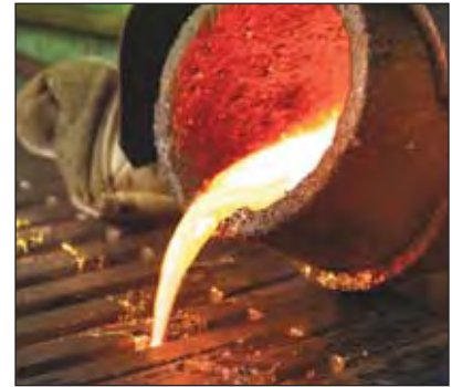
Pouring molten gold.