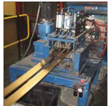
These long, flat bars, after rolling, will be cut with a die to produce blanks for minted bars.