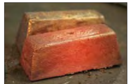
Rand Refinery refines around 75% of Africa's newly-mined gold doré.