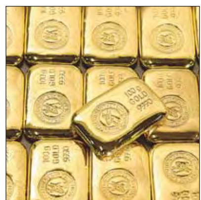
100 g bars have been manufactured since 1985.