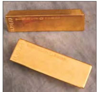
Rand Refinery has manufactured more London Good Delivery 400 oz bars than any other refiner.

Annual gold refining capacity is recorded at approximately 600 tonnes.