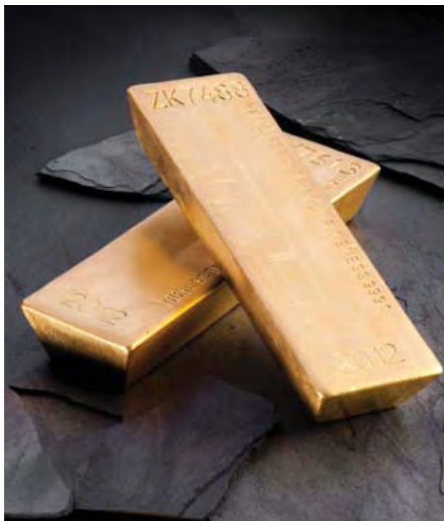
Rand Refinery has applied a new official stamp to London Good Delivery 400 oz bars since 2011.