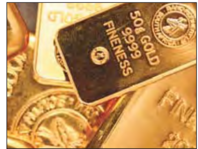
Minted bars will be manufactured for the international market in 2012.