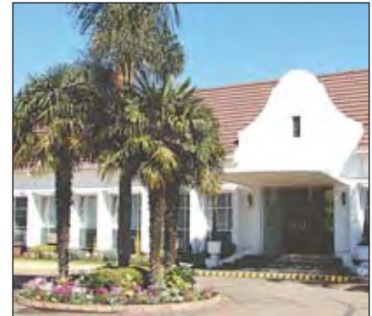
Rand Refinery operates the world's largest gold refining and smelting complex.

When the new refinery complex was opened in 1989, it was the world's first refinery to automate the manufacture of 400 oz bars from the time molten gold is poured into the crucible.